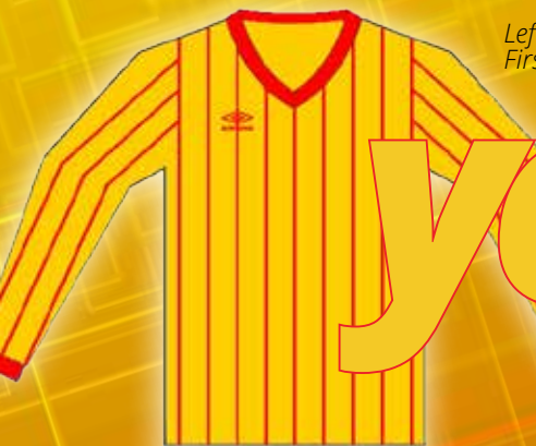
Left: The 1985/86 First Team kit