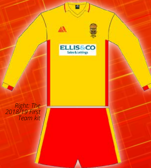
Right: The 2018/19 First Team kit

TFFC's yellow and red colours originated in a sketch on the cover of the 1973/74 TFFC handbook. Not until 1985 did the Club first wear this combination. Since then, yellow and red have proudly become the Club's traditional colours.